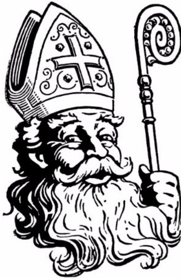
St. Nicholas of Myra from whom we get the idea of Father Christmas

Christmas is coming! Its exciting isn't it and I'm quite happy to admit that even in my 'later middle age' there is still a thrill as Christmas approaches. That's why Advent is such a perfect season as we wait with anticipation for the coming of the Son of God!