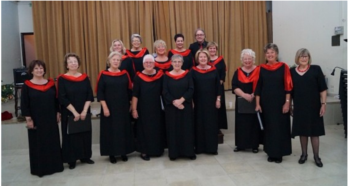
The Goergie Insull Singers all dressed up and ready to go!

The Goergie Insull Singers are performing at the Palma Anglican Church on Friday, 15th beginning at 8pm. But this will be their last concert, hence the title; 'The Last Noel'. They are retiring from concert performing although still meeting to sing together for smaller events and for the occasional church service or wedding.