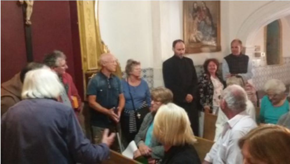
Christians of many denominations led in prayer by our Rumanian Orthodox priest

Thursday, 25 th - The Religious Orders of Mallorca , 6.30pm, Sta Magdalena Convent, Palma