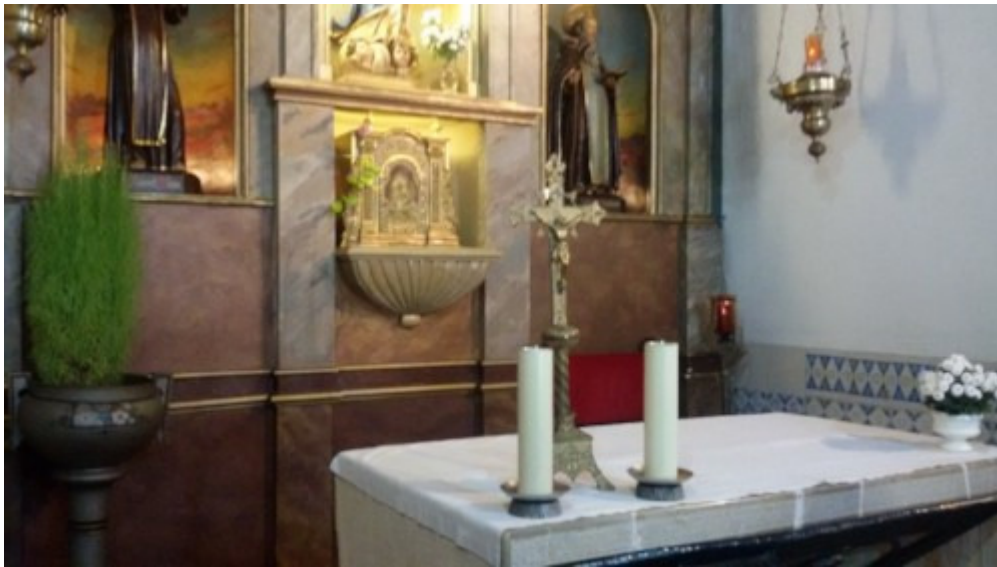
The altar at a local chapel during an ecumenical pilgrimage

During the Week of Prayer for Christian Unity we are invited to take part in each others worship at different churches throughout Palma. This is a great opportunity to expand our understanding of the Christian faith.