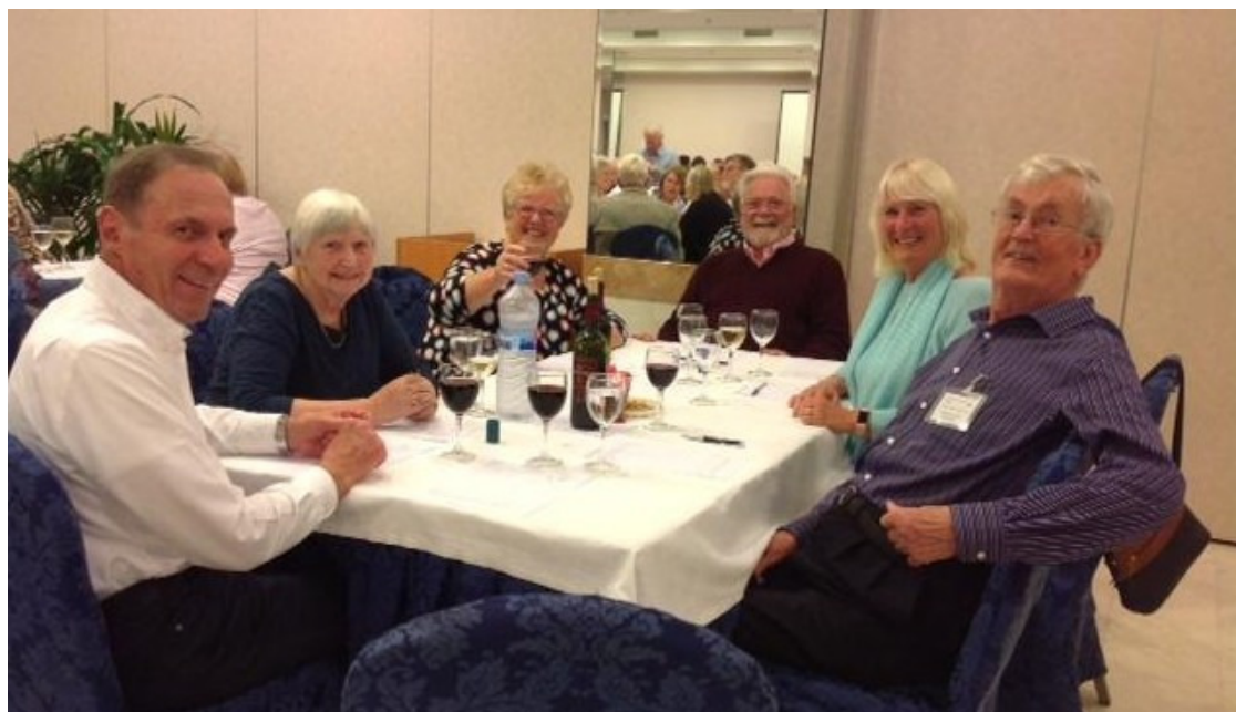
The reps from Palma enjoying the Beetle Drive on the closing evening

We also took part in some memorable acts of worship including a trip to the local Catholic parish church, used by the Torriaveja Chaplaincy, for one of these occasions.