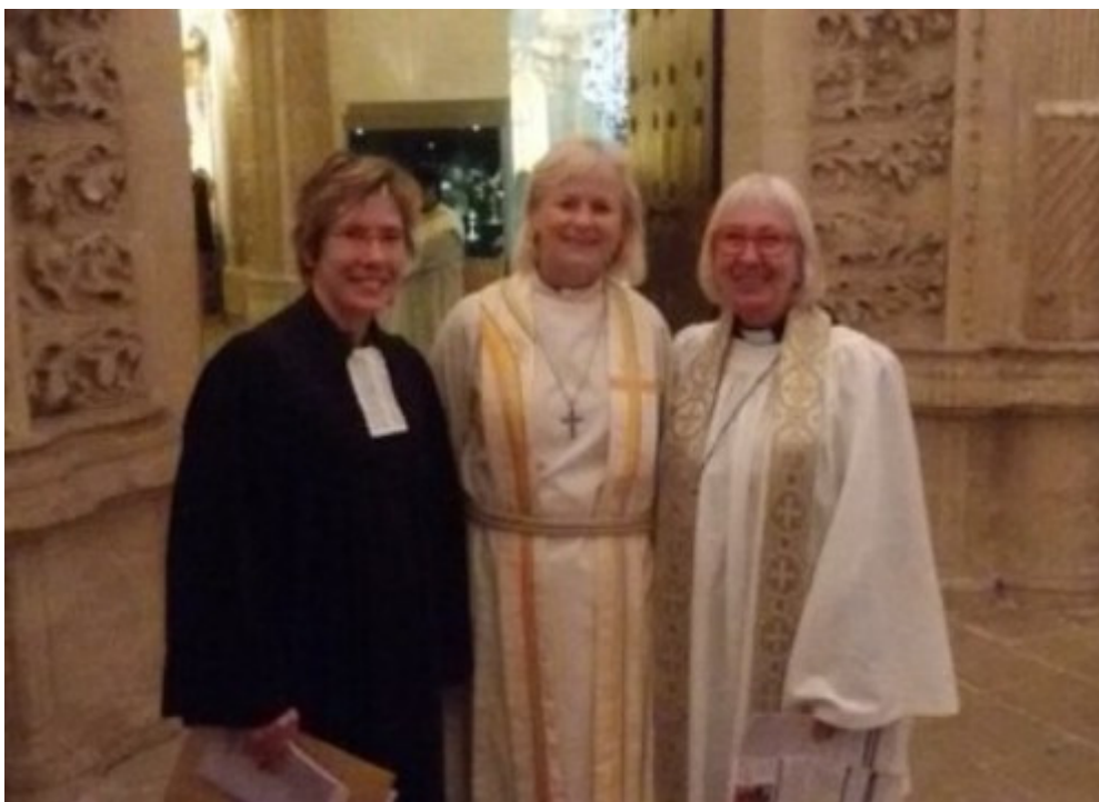
Ecumenical priests from German, Norwegian and Swedish Churches

Christians from many different denominations gathered in Palma Cathedral on the evening of Sunday, 21st January to celebrate Christian Unity Week.