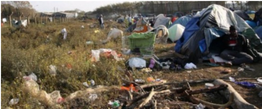
A part of the 'jungle' refugee camp at Calais

The Anglican Chaplaincy for Mallorca is supporting the Bishop's Lent Charity;