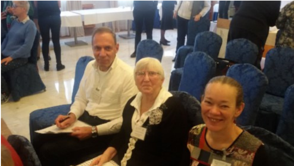
Reps from Mallorca at one of the Synod sessions

The annual Gibraltar Archdeaconry Synod meeting took place over the week beginning, 29th January of this year.