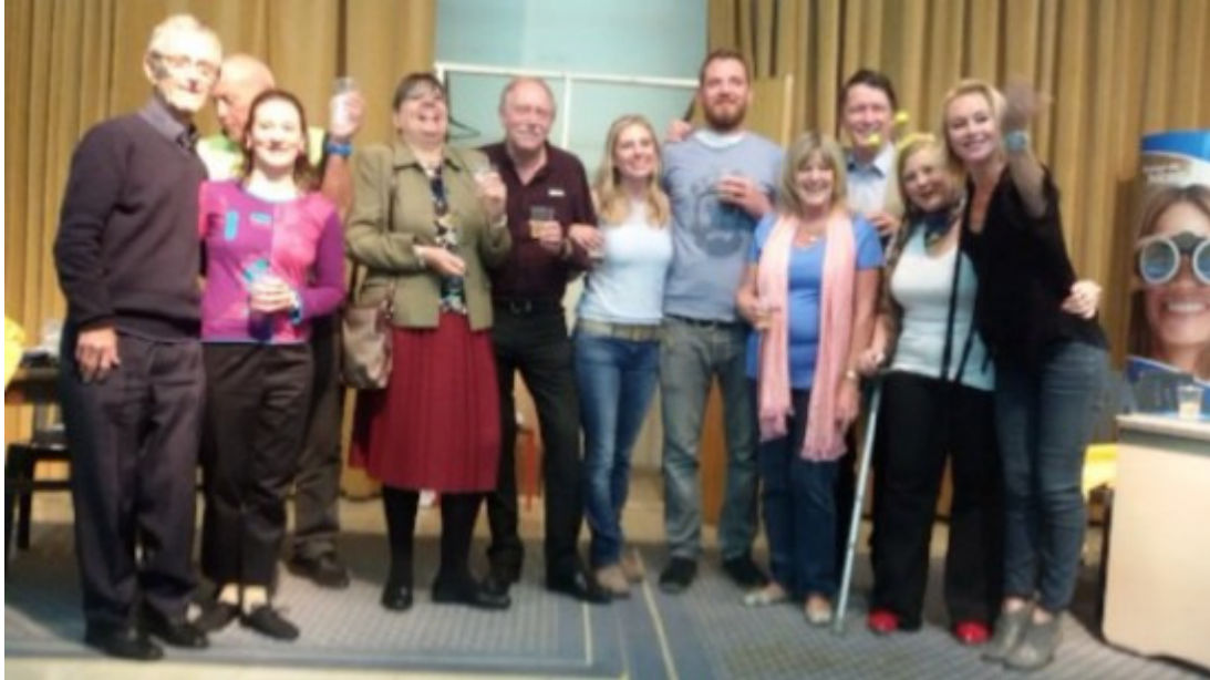
ACDC cast members from a previous performance