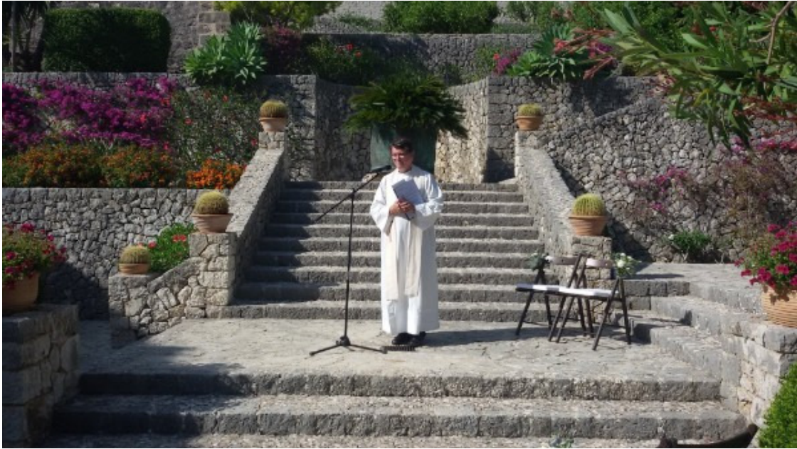
Yours truly posing at Finca Son Berga before a wedding

The wedding blessing season is well underway for the clergy of the Mallorca Chaplaincy and here are a few pictures of some of the lovely places we have the privilege of leading services in.