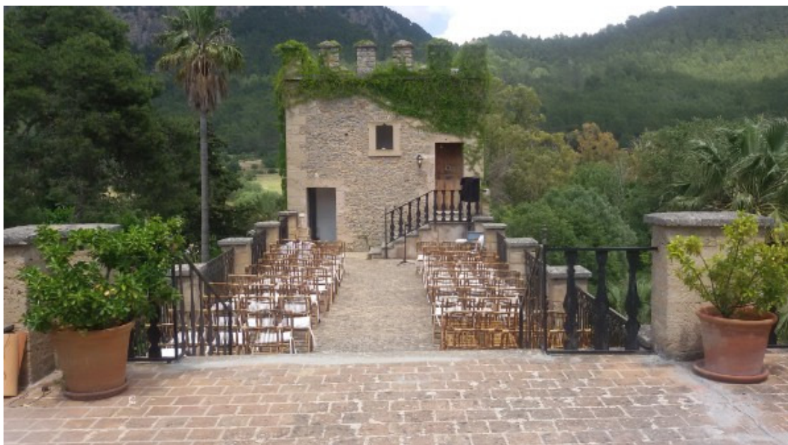
Finca Son Pont near Puigpunyent in the west of the island.