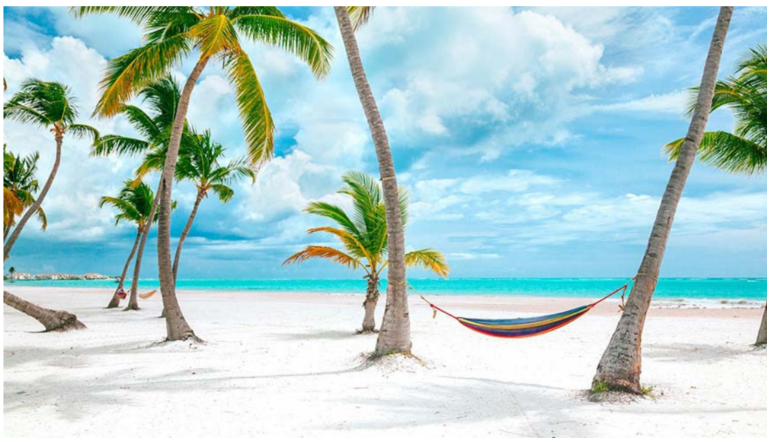
Clergy annual leave location

Welcome to our July newsletter! As you will realise its slightly early in the month for you to be receiving it but this is due to working around clergy annual leave.