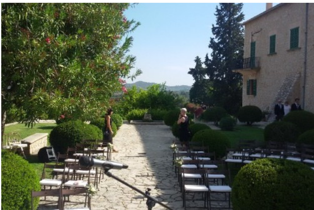
Finca Son Berga near Alaro, looking down into the congregational area

Here are a few photos of some of the locations that we take wedding blessings in. A few more next time!